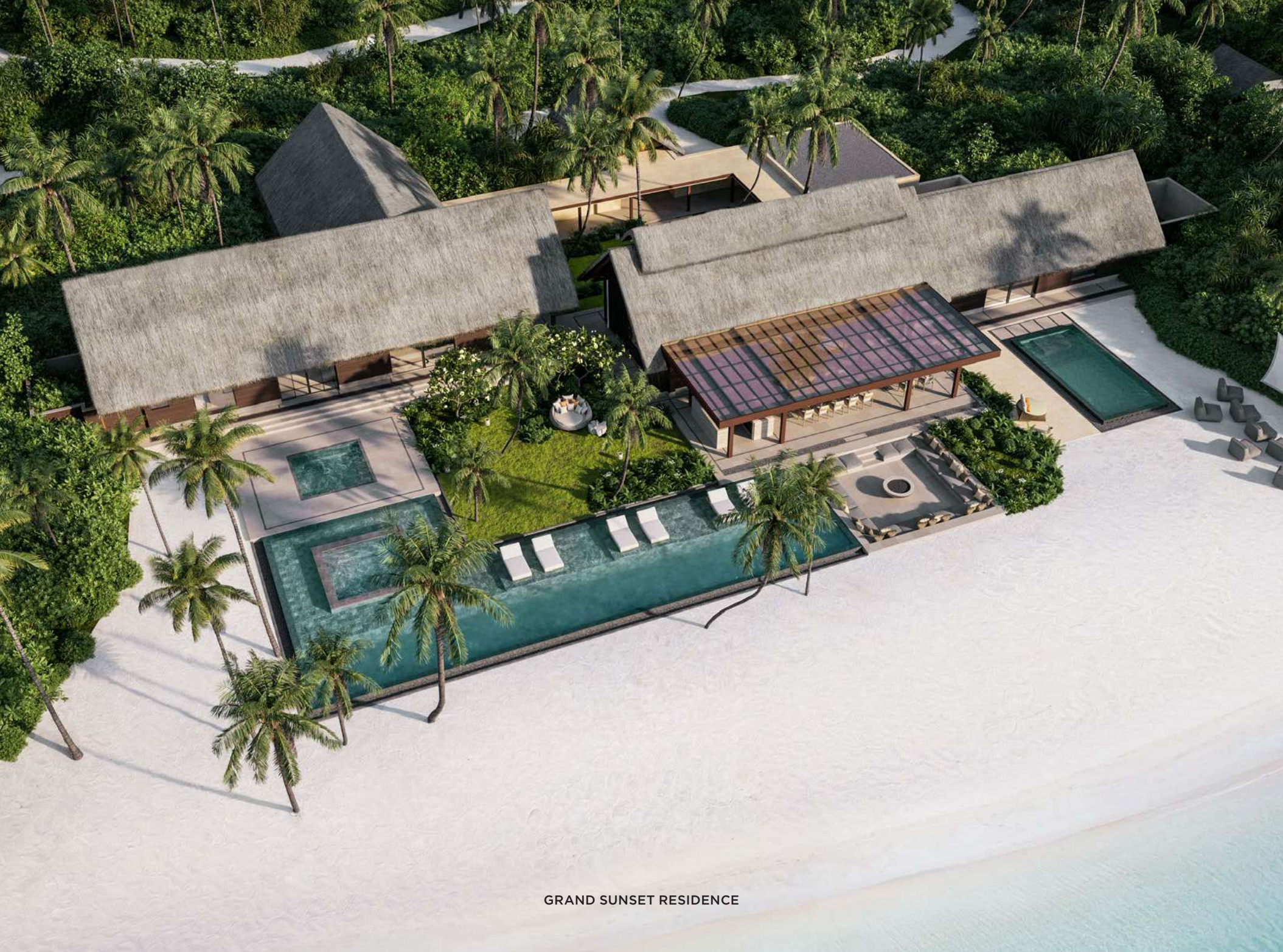
GRAND SUNSET RESIDENCE